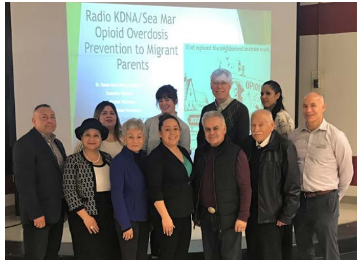
The Community Health Worker Coalition for Migrants and Refugees meets for a workshop on opioids.

The overall goal of our curriculum was to inform our communities about the issue and how to respond in case of an overdose event by increasing awareness in Yakima and Pierce Counties.