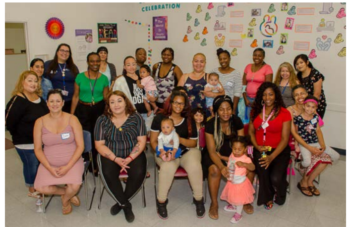
Mothers attend the first Soul Food for Your Baby breastfeeding support group at Black Infant Health at The Children's Collective, Inc., in the Crenshaw District in January 2020.

which 15 Black and Latina families attended. We engaged community members at a farmers' market in the Crenshaw District in Fall 2019. For BBW 2020, we held a Black Breastfeeding Matters Walk in August that raised funds and awareness. We also partnered respectively with Mahmee and the African American Infant and Maternal Mortality Initiative for a Doula Meet Up in June and breastfeeding webinars during BBW and Black Maternal Health Week in April 2020.