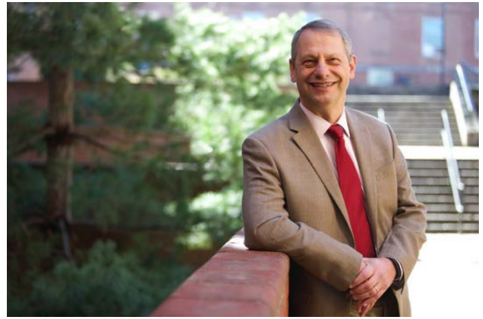
Retired RADM Boris D. Lushniak, MD, MPH