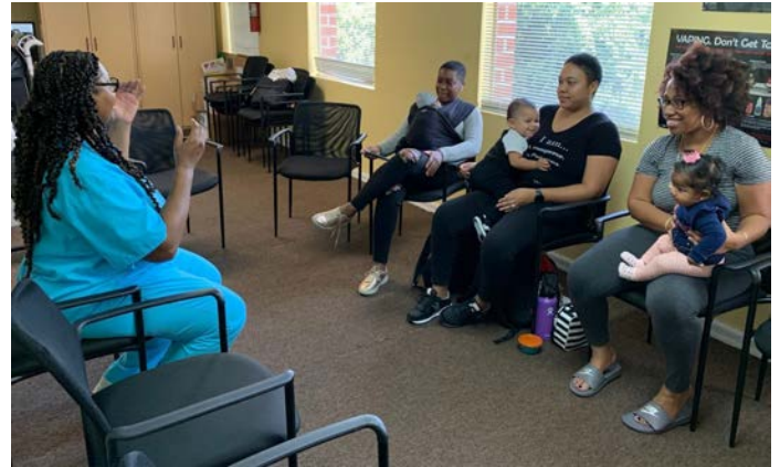
Mothers and children attend the Breastfeeding Celebration during Black Breastfeeding Week in August 2019. Soul Food for Your Baby and the Compton WIC site co-hosted the gathering.

In addition to the classes and support groups, SFYB co-hosted a Breastfeeding Celebration with the Compton WIC site during Black Breastfeeding Week (BBW) in 2019,