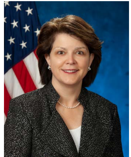
Retired Colonel Molly Klote, MD, USA

As you may be familiar, most studies struggle to recruit enough racial and gender diversity to allow for significant discoveries in these understudied populations. Women also report differences in health conditions like heart disease, depression, hypertension—not to mention illnesses like breast and cervical cancer where researchers can only draw from women cohorts.