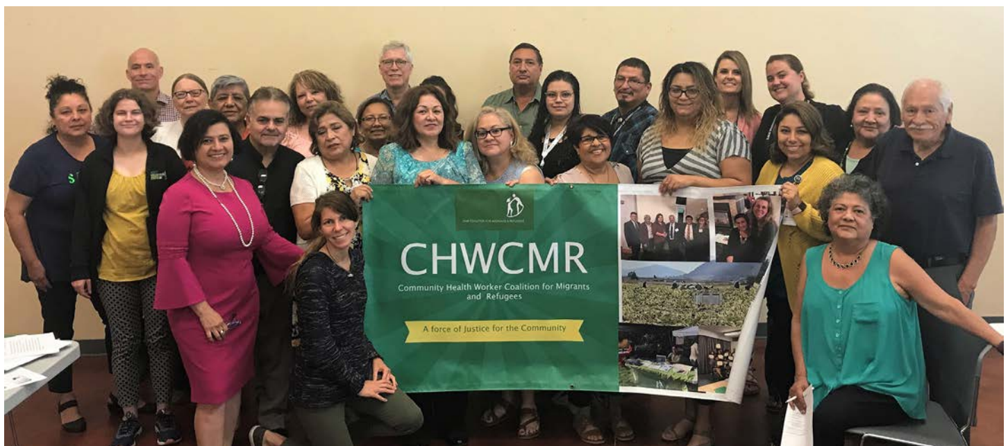
Attendees of the CHWCMR conference in Granger, WA.